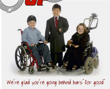
We're glad you're going behind bars for good!

✦ We were invited to participate in the Veterans Day Parade on Thursday, November 11 at Main Street. Grades 2-5 marched in the parade and PS-K-Gr1 watched. Thank you to parents who helped!